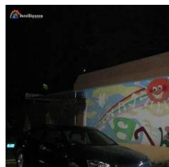
With white light