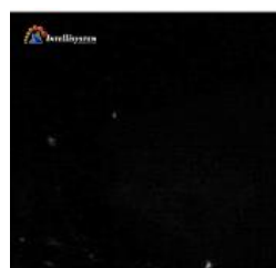
Without white light